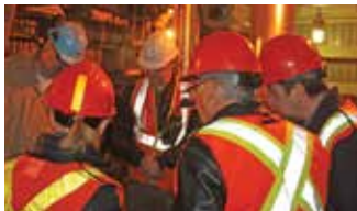
CANADIAN TRANSPORTATION AGENCY Visit