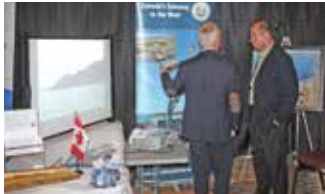
PROSPERITY NORTHWEST Business Forum