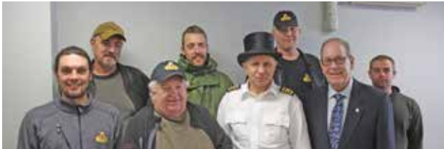
FIRST LAKER Top Hat Ceremony