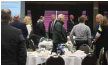
OPENING OF NAVIGATION Luncheon