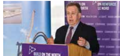
NOHFC FUNDING ANNOUNCEMENT for Terminal Expansion and Reconfiguration